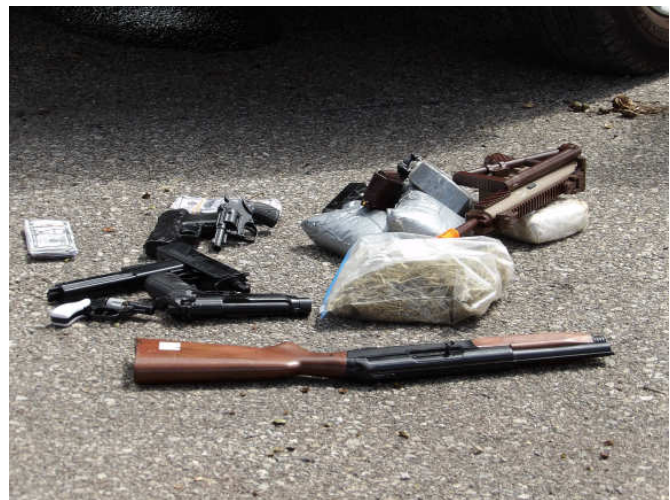
36 / Winter 2017