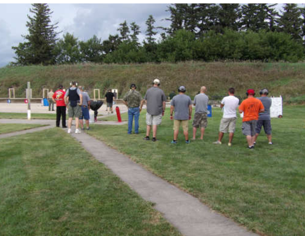
34 / Winter 2017