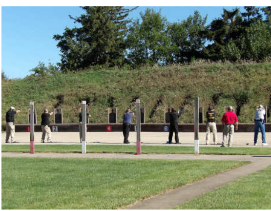
Winter 2017 / 31