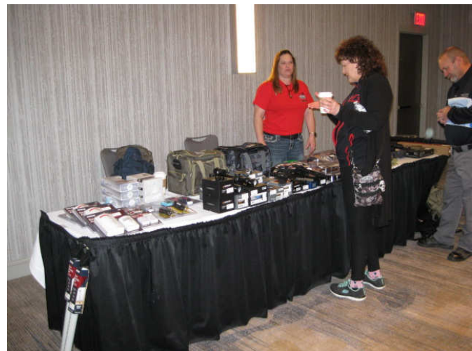
Davenport Guns was an exhibitor