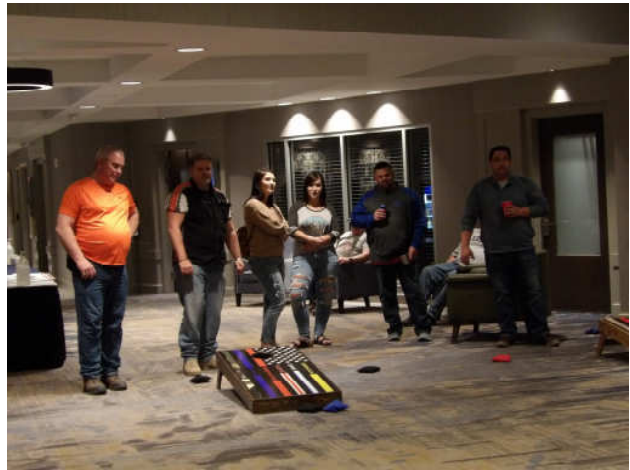
The bags tournament is always popular