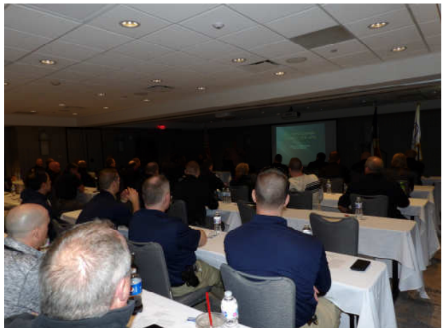
Attending the Saturday afternoon seminar