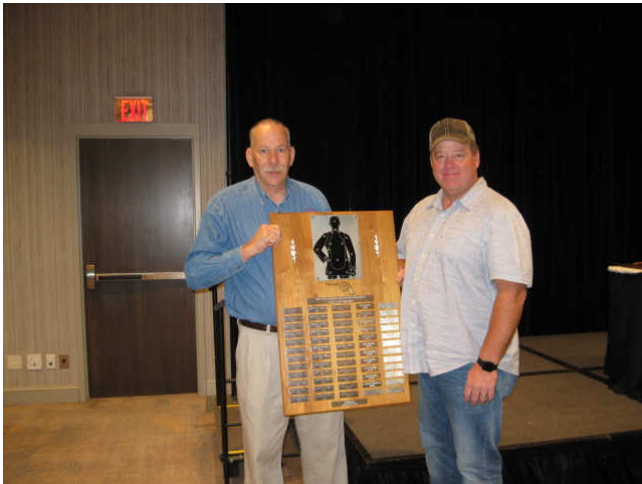
Linn County Sheriff's Reserve 2019 state reserve team shoot winners