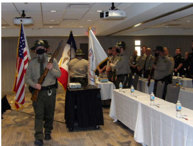
Buena Vista County Reserve Deputy Color Guard presented the colors