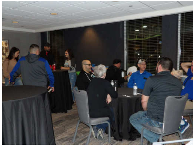
Enjoying the ISRLOA hospitality area