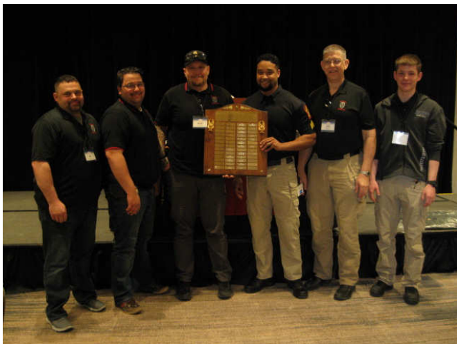
Atlantic Police Reserve 2020 Outstanding Unit Award winners