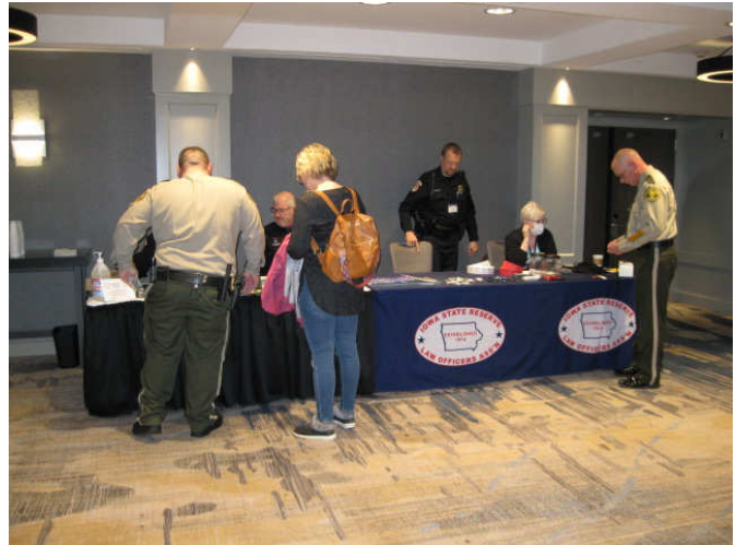
The Registration Table

The 50th Annual Conference and Business Meeting will be held at Storm Lake on April 1-2-3, 2022.