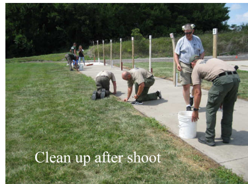
Clean up after shoot